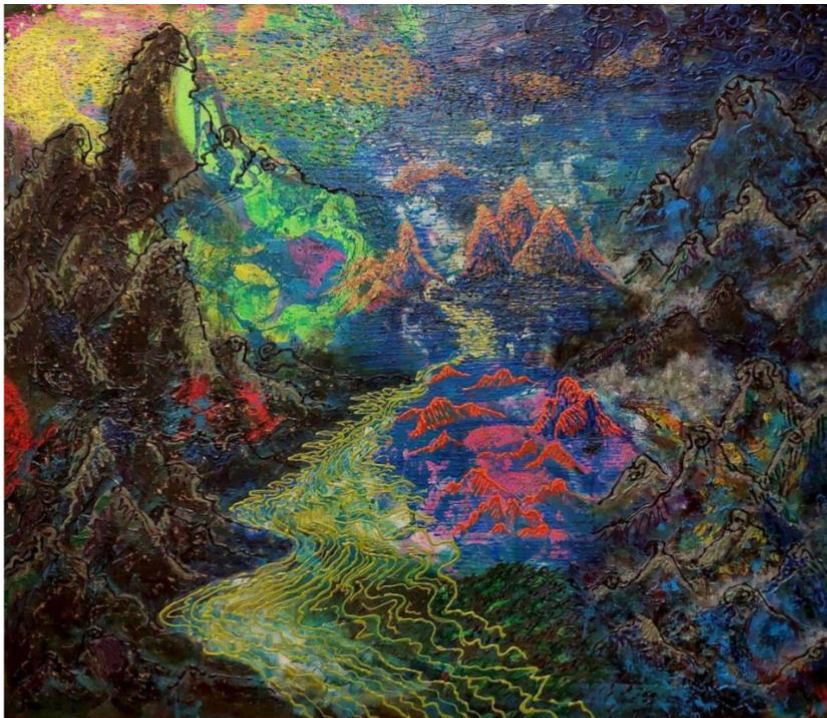
Sunset Sunrise --2021

An artwork continues after the Stage Series, to keep on sharing narrative inspiration with spectators. What the image represents a gendered self, we can easily associate with it in a similar situation of struggle. Whatever the nature of the struggle is it. About humanity , about life and love.