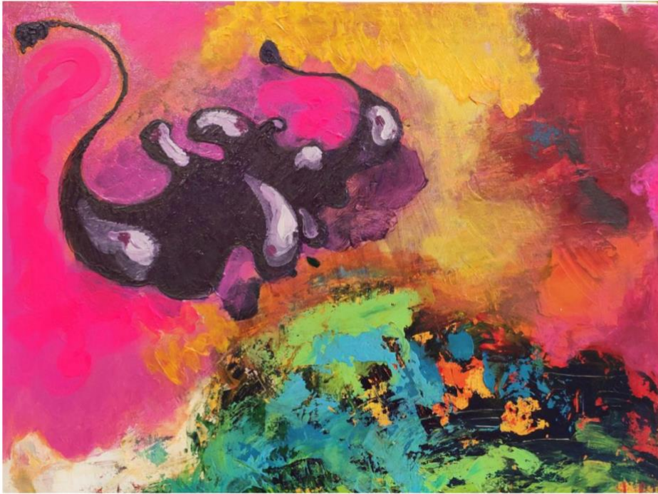
Landing on a No-man Island

An artwork continues after the Stage Series, to keep on sharing narrative inspiration with spectators. What the image represents a gendered self, we can easily associate with it in a similar situation of struggle. Whatever the nature of the struggle is it. About humanity , about life and love.