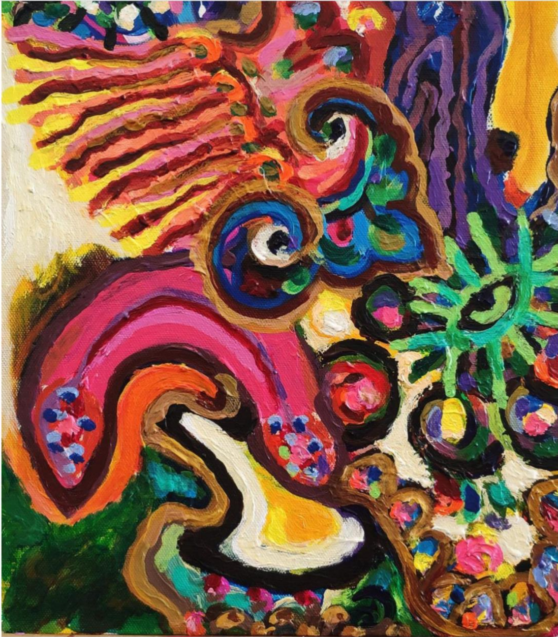
Melodic Ensemble II - 2013

A series of work inspired by the music components of the Cantonese Opera. To an extension of abstract expression, the Material cultural are composed as the visual language to induce spectator into the ensemble, to start communication with oneself, through one's spirit, soul and body.