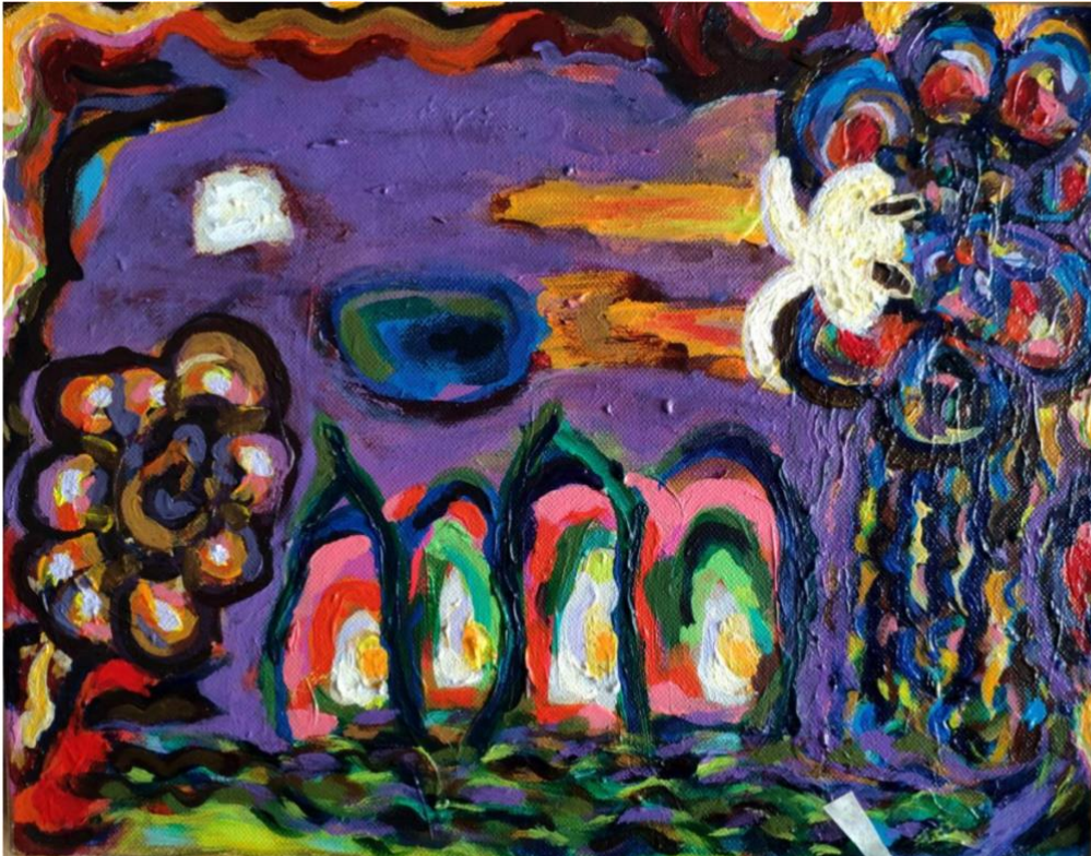
Stage Series #7 -- Curtains up

Language is a tool for communication, however, visual language is another form of art to induce dialogue between spectators oneself, or others. The images represent each of our difference. Somehow, even speaking in the same language, communication wasn't as effective as its function failed. My question is "What is the effective way to talk with each other? "