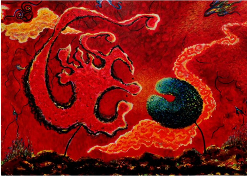
In Dialogue -- 2016

Language is a tool for communication, however, visual language is another form of art to induce dialogue between spectators oneself, or others. The images represent each of our difference. Somehow, even speaking in the same language, communication wasn't as effective as its function failed. My question is "What is the effective way to talk with each other? "